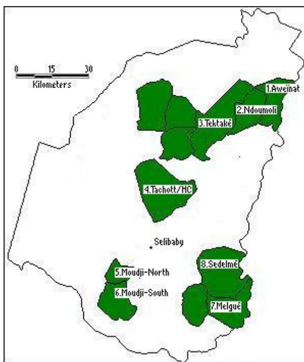
Map 4 – Wilaya Guidimakha: Progress in preparing local agreements (April 2006)

Source: Adapted from a map prepared by project ProGRN.