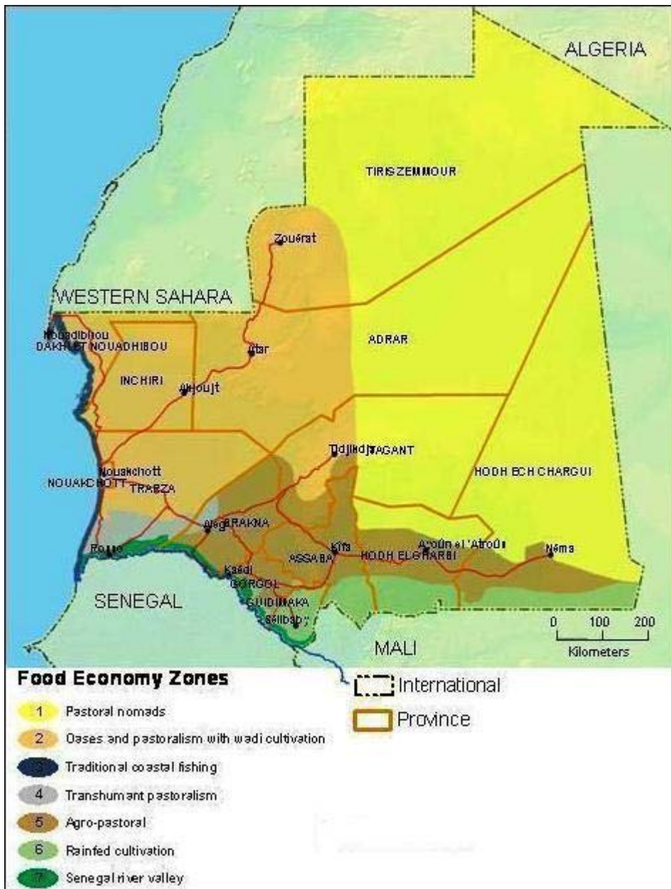
Map 2 – Mauritania: Map of the country